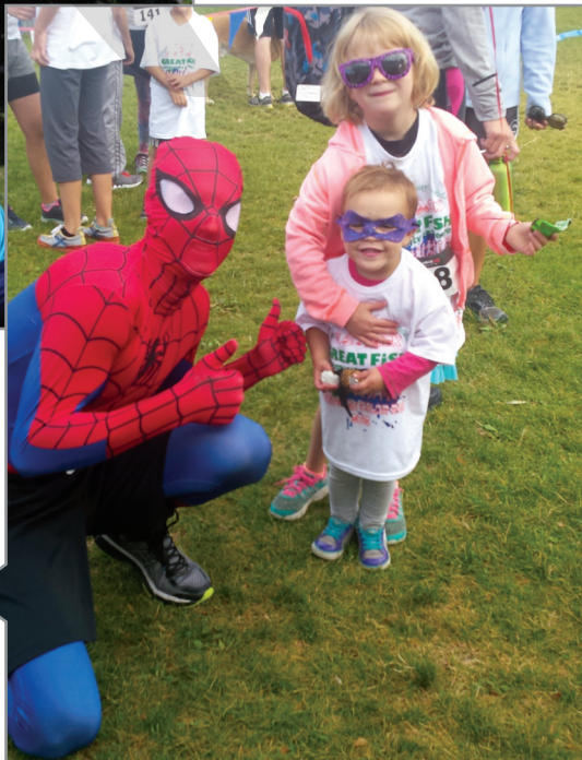
We were part of the Great Fish Community Challenge and had a great super hero booth at the color run!